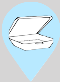
Polystyrene/ Rigid Plastic